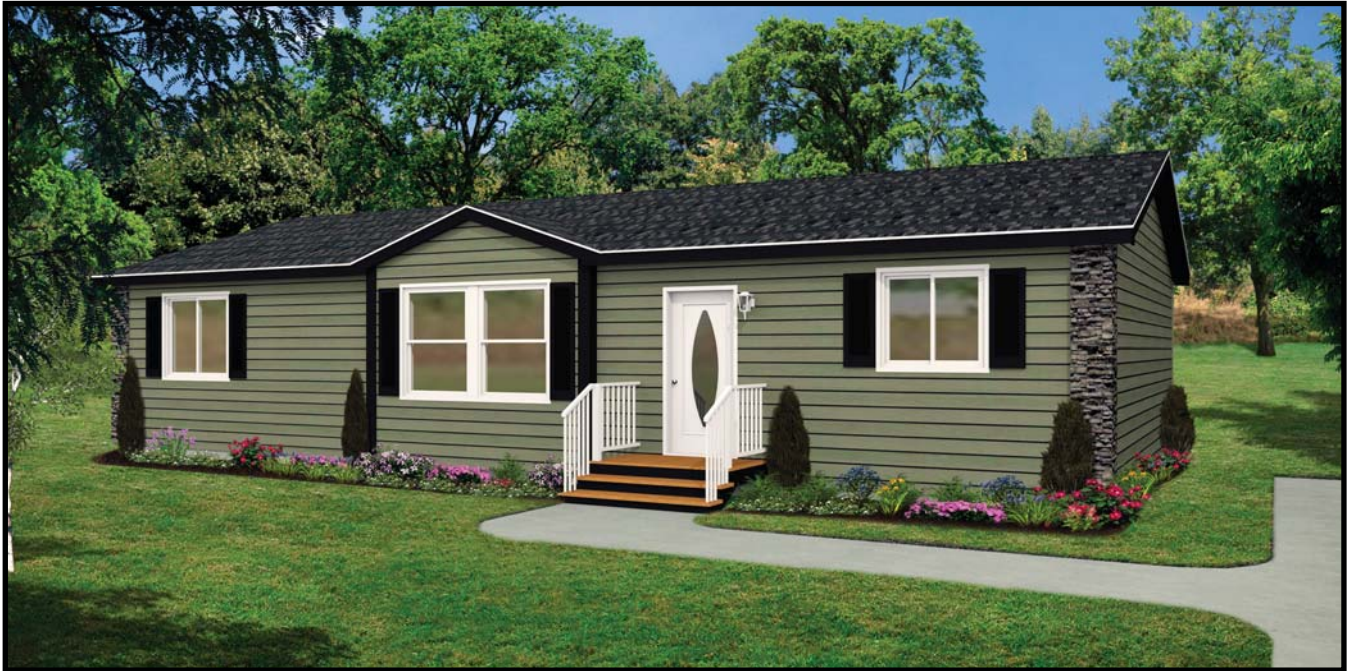
"The DE-361" 26' x 52' 1,352 sq.ft.