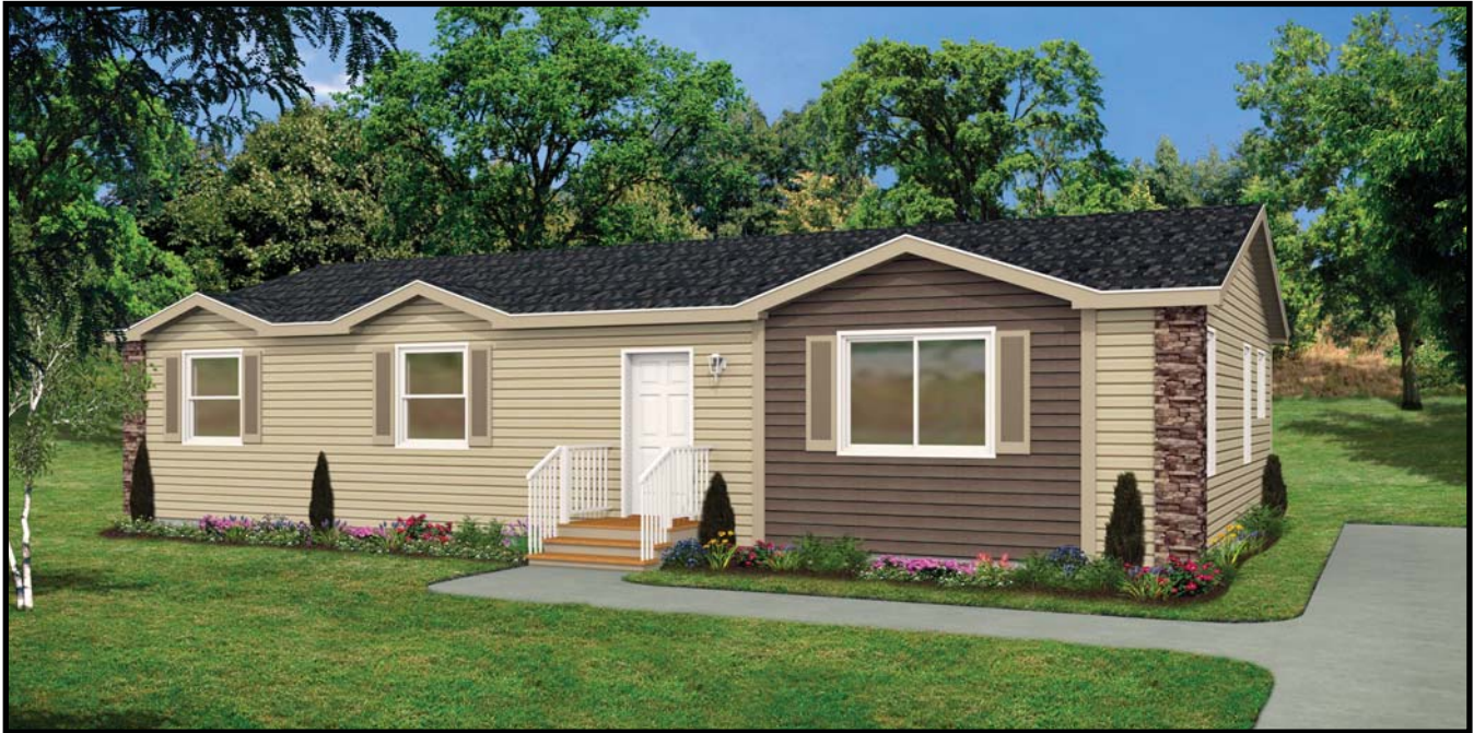
"The DE-363" 27' x 52' 1,404 sq.ft.