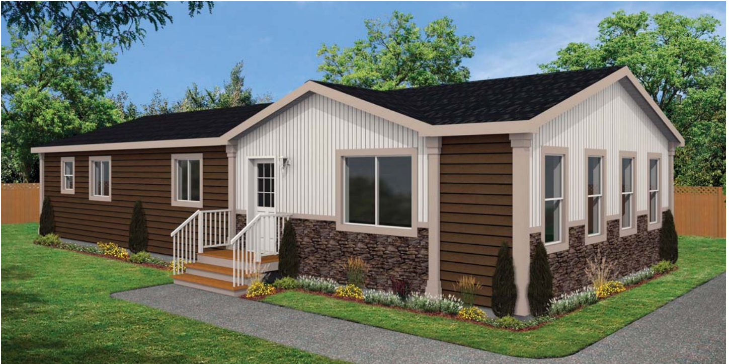
ML-246 24' x 60' • 1,440 sq. ft.

Proudly made in Canada to Canadian Standards