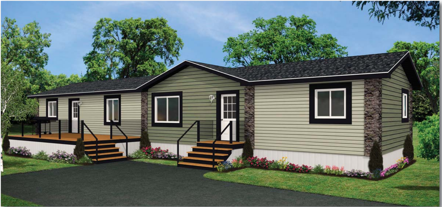
ML-204 20' x 76' • 1,520 sq. ft.

Proudly made in Canada to Canadian Standards